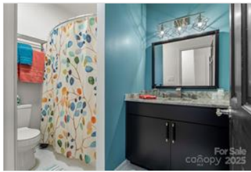
2nd floor full bathroom