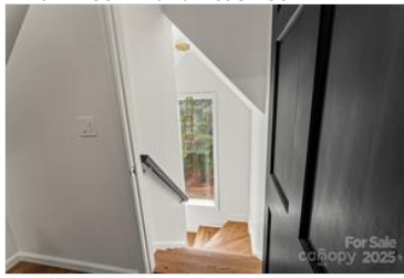
Stairway to second floor