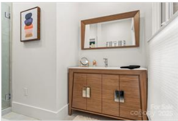
Main floor 2nd full bathroom