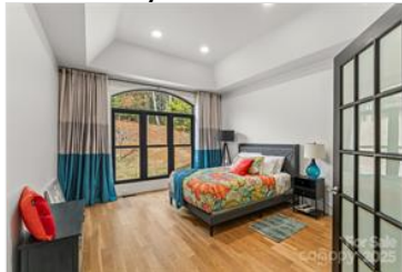
Main floor second bedroom