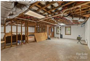
Basement - plumbed for bathroom