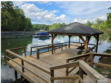
Private gazebo & dock in Sherman's Cove