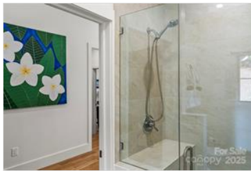
Main floor 2nd full bathroom