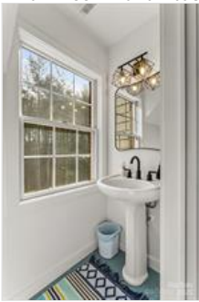
Main floor half bath