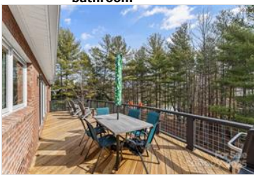
Large, private back deck