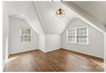
2nd floor bedroom (3rd)