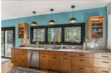
Custom cabinets, doors and windows