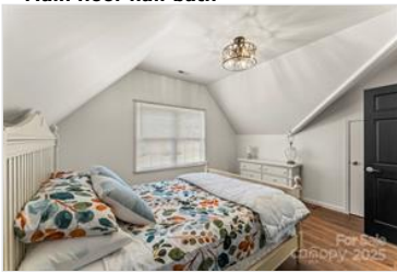
2nd floor bedroom (4th)