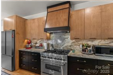
Custom cabinets, new appliances