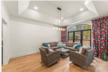
Dining room or family room